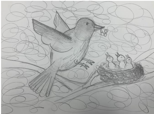
Option 1 – KG, Grade 1, 2

Option 2 is suggested for Grade 3, 4 and 5.