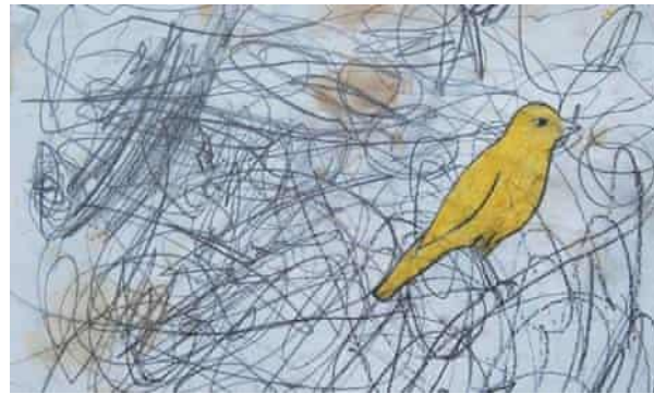
Canary and Tangles (1991)

Artist's Interpretation – The current COVID-19 situation that we are in is such that everyone has to be safe. Most children are staying inside their own homes and parents are helping them more than ever with studying, playing and everything in between. This reminds me of how parent birds feed their babies in the nest and take care of them before the babies learn to fly. Self's representation of birds in his different artworks is an inspiration here for us to draw the same.