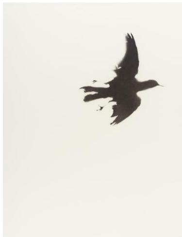
Black Bird 2 (1970-1)