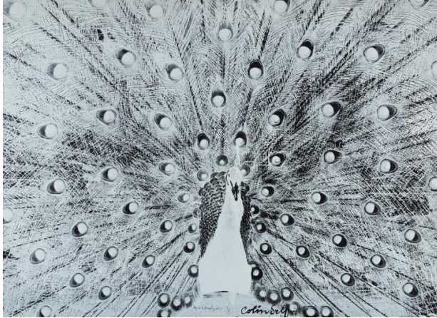
Power and Beauty (1968)