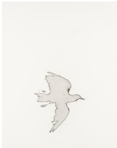
Black Bird 1 (1970-1)

Currently his artworks are exhibited and owned as public collections by highly reputable galleries in England such as Museum of Modern Art, Tate Gallery and more. He lives in his home town Norfolk which is in Britain’s countryside. The local landscapes of Norfolk have inspired him as an artist which is reflected in his artworks.