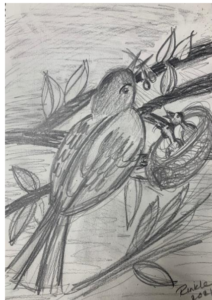
Option 2 – Grade 3, 4, 5